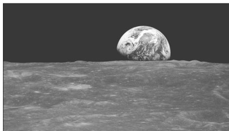
Earthrise over the moon, as seen from Apollo 8 on December 24, 1968.

Many common questions students ask Christians relate to this issue. Scientists who are committed to methodological naturalism (that truth is by definition limited to explanations from the natural world) reject God and purpose in nature. They say, “All is explained by chance—random mutation and natural selection.” The Bible says that they are “without excuse” (Romans 1:20) because the evidence for God’s wisdom and power is actually revealed in nature. That truth is now being manifested in the discoveries of science itself.