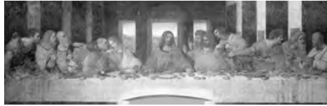
The familiar representation of the Last Supper , a mural by Leonardo da Vinci. (Public domain)

That night in the Upper Room Jesus said (John 13:19), “ From now on I am telling you before it comes to pass, so that