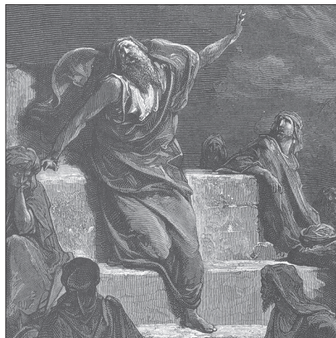
The prophet Jeremiah, as depicted in this woodcut, ca. 1866, by Gustave Doré (public domain).

Smoke blanketing the United States from Canadian wildfires on May 22, 2023. (Image credit NOAA Air Resources Laboratory. Public domain.)