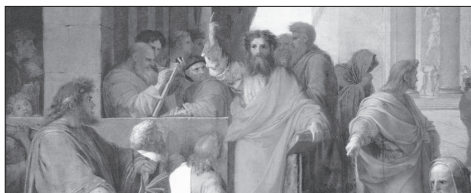
The apostle Paul was depicted preaching at Ephesus in this oil painting, ca. 1649, by French artist Eustache Le Sueur (public domain).

I am amazed that you are so quickly deserting Him who called you by the grace of Christ, for a different Gospel...[they] want to distort the Gospel of Christ. But even though we, or an angel from heaven, should preach to you a Gospel contrary to that which we have preached to you, let him be accursed (Galatians 1:6-8 Emphasis added).