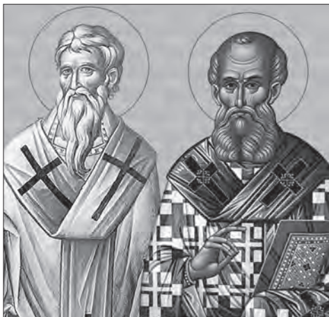
Irenaeus (left, c. 130 - c. 202 AD) quoted and referred to all but a few of the books in our New Testament. Athanasius of Alexandria (c. 296/298 – 2 May 373) published one of the first lists of all twenty-seven books in our New Testament.

Here I want to examine how various “Christian” groups measure up to the Protestant Reformers’ position that final authority is exclusive to Scripture ( sola scriptura ). A corollary to that is whether some “Christian” groups might have a “ different spirit ” (2 Corinthians 11:4).