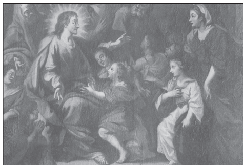
Let the Children Come to Me, by an unknown author, from the Swedish National Museum in Stockholm (public domain).

Two significant attributes are often used to describe God in the Old Testament: lovingkindness and faithfulness (Psalm 100:5). The Bible says these endure forever and continue through all generations. Lovingkindness consists of “love” plus “goodness” which is equivalent to the concept of “ grace ” in the New