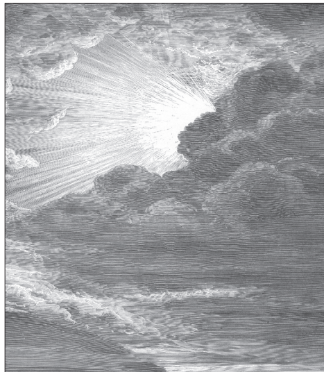
The creation of light, as depicted in this woodcut, ca. 1866, by Gustave Doré (public domain).

Testament. Faithfulness is often translated interchangeably with “ truthfulness. ”