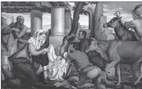
"Adoration of the Shepherds" by Jacopo dal Ponte, ca. 1548.

The Psalmist anticipates our own response: "Let us come before His presence with thanksgiving; Let us shout joyfully to Him with psalms" (95:2).