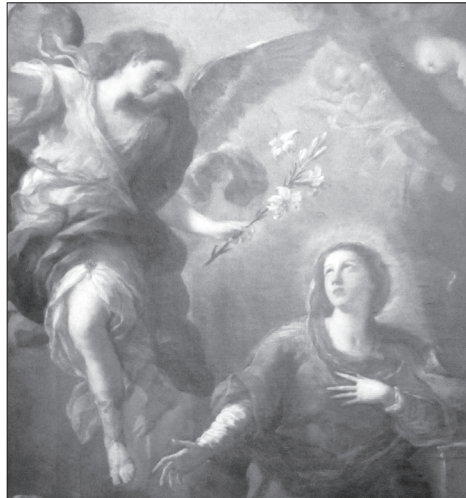
"A representation of The Annunciation to Mary, by Luca Giordano, ca. 1672 (public domain).

The four candles represent the virtues which Jesus brings: hope, peace, joy, and love , in that order. The first, second, and fourth candles are purple, the primary color of Advent symbolizing royalty. The third candle is pink, the liturgical color for joy. The larger center candle, symbolizing Jesus' birth, is white for purity or perfection.